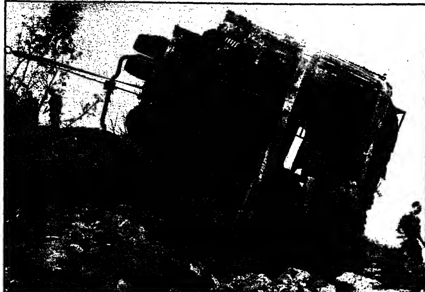
A firebombed IDF bus lies on its side near Ramallah yesterday, after rescue workers finished evacuating the 11 soldiers and the driver who were injured.